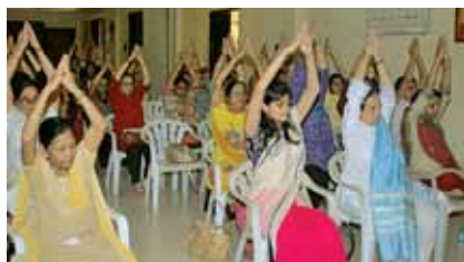
Members practise Yoga for Wellbeing & Health.

There's never a dull moment at the Club's GBMs and events. Interesting speakers liven up every meeting and our members always add to the fun.