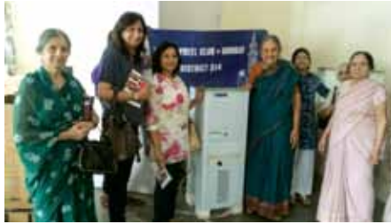
Gift of a water cooler to Bapnu Ghar.

Adding cheer to their lives, extending a helping hand... we continue the tradition because it makes such a difference.