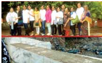
'Check Dam' Project at Talasuri Taluka.