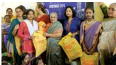
Haldi-kumkum celebrations with the students of the Vocational Centre.