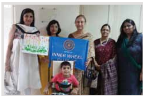
Donation of CP chairs.