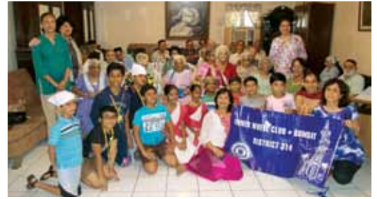
CSED kids entertain elders.