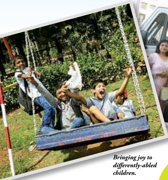
Bringing joy to differently-abled children.