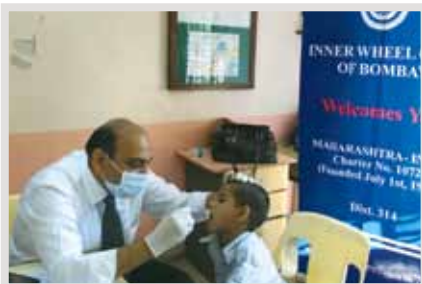
Medical Camp at SEC school, Agripada.