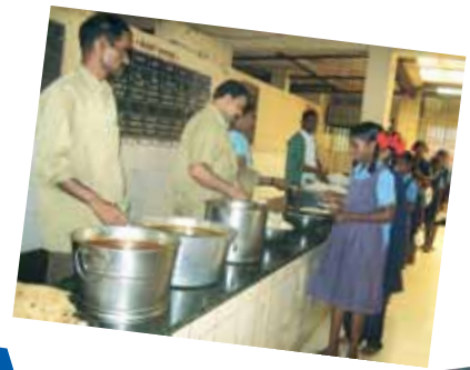
Providing nutritious meals for rural school children.