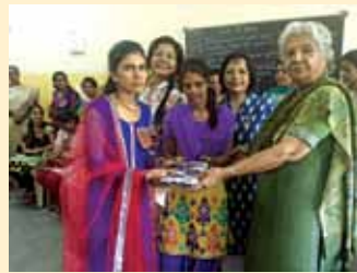
Prize-giving at the annual competitions.