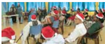
Celebrating with residents at Dignity Lifestyle Township.