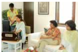
Our nightingale Padma Shri Sudha Motwane regales members.