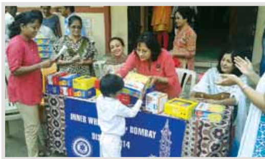
Prize-giving at BIDM sports day.