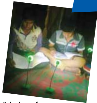
Solar lamps for remote villages.

Our Club is a major contributor to District 314's integrated Rural Development Programme covering 40 economically backward villages near Panvel, providing infrastructure, drinking water, sanitation, cow fodder, etc.