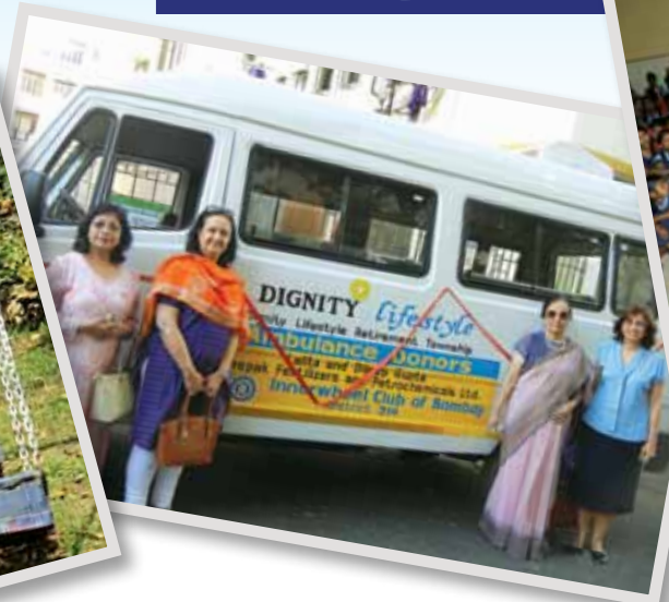
Ambulance donated to senior citizens.