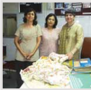
Kangaroo bags and nesting kits supplied for neo-natal ward at KEM.