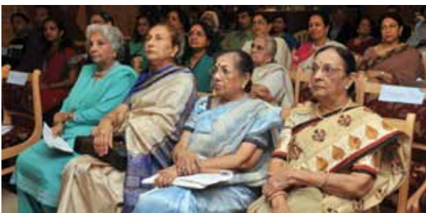
Bombay Club seniors at the installation.