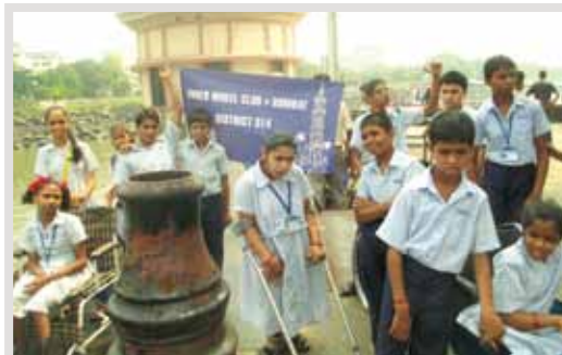
Outing to Apollo Bunder with SEC children.