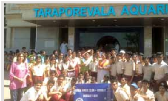
BIDM and CSED students visit the Aquarium.