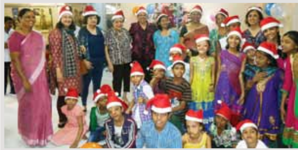
Christmas party cheer at SEC School.

Members never turn away from reaching out a helping hand to disadvantaged children. Our support is ongoing to SEC (Society for the Education of the Crippled), CSED (Central Society for the Education of the Deaf) and BIDM (Bombay Institute of Deaf and Mutes) through donations, equipment, medical camps, picnics, Christmas party, outings, and much more.