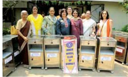
Donating lockers for the old age home at Shantivan.