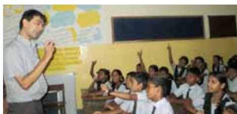
Spreading awareness by Welfare of Stray Dogs.