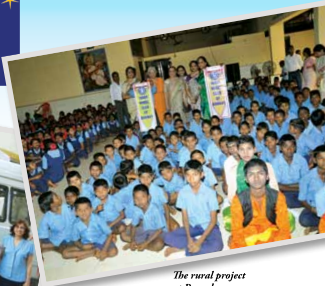
The rural project at Panvel.