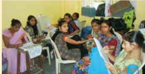
Learning skills at the Vocational Centre.

Our Club has long supported the entrepreneurial spirit in women through micro-credit schemes and vocational guidance and training. It runs a Vocational Guidance Centre at Dr. Babasaheb Ambedkar Municipal School, Worli, where courses are held in tailoring, beauticians' training, etc.