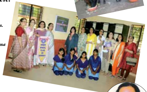
'Help a Child' provides education and maintenance for over 300 children.