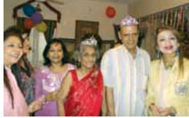
Crowning the dancing King & Queen of Parukh Dharamshala.