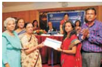
The Third Mira Mehta Award was presented to Rescue Foundation, Mumbai.