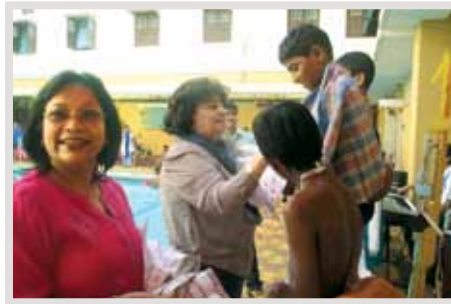
SEC schools' swimming gala.