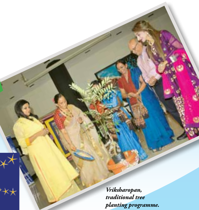
Vriksharopan, traditional tree planting programme.