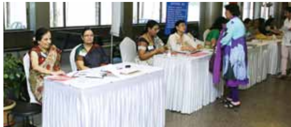
Handling registration at the District Rally.

Having played a pivotal role in establishing District 314, Inner Wheel Club of Bombay continues to contribute actively to support its projects and activities.