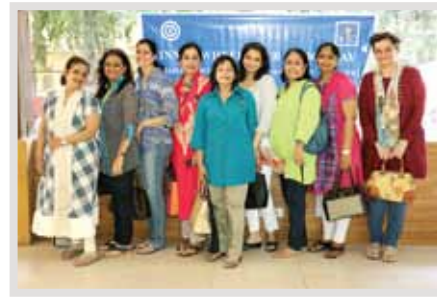
Zone I Presidents at the SEC picnic.